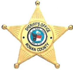
TRAVIS ALLEN SHERIFF