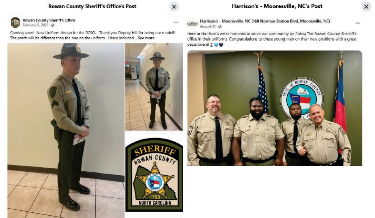
Figure 4: Rowan County Sheriff's Office Uniforms