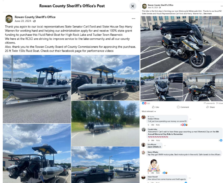
Figure 1: Rowan County Sheriff's Office's June 19, 2024 and June 20, 2024 Facebook Posts.

A review of the Sheriff's Office's proposed vehicle replacements and fleet expansions for FYs 2022 through 2024 and approved budgets revealed that the vehicle models reported to OSA were either already a part of the Office's existing fleet or were approved as replacement vehicles in the Office's proposed budget. 2 (See Figure 2). Annually, a portion of the Sheriff's Office's fleet is assessed to determine whether replacement is necessary. Extremely high mileage and mechanical failure are two factors that warrant vehicle replacement. These facts also suggest that the allegation regarding the Sheriff's Office making excessive and unnecessary vehicle purchases is unsubstantiated.