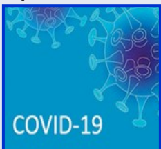
OSA in the COVID - 19 Era